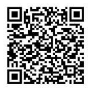
St Oswald's Church

St Oswald's and St Mary's churches are open every day of the week. If you would like to make a donation to the work of St Oswald's or St Mary's you can do so by scanning the following relevant QR Code below and making a donation: